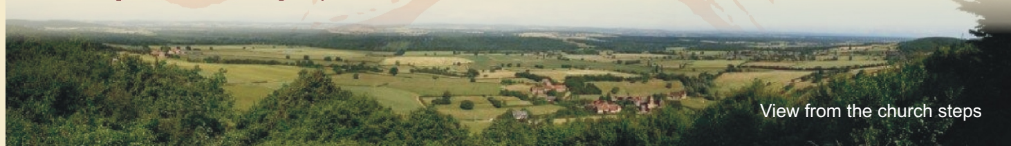
View from the church steps

- Or from the whimple worn through the 12th to 15th centuries by elderly women and nuns.